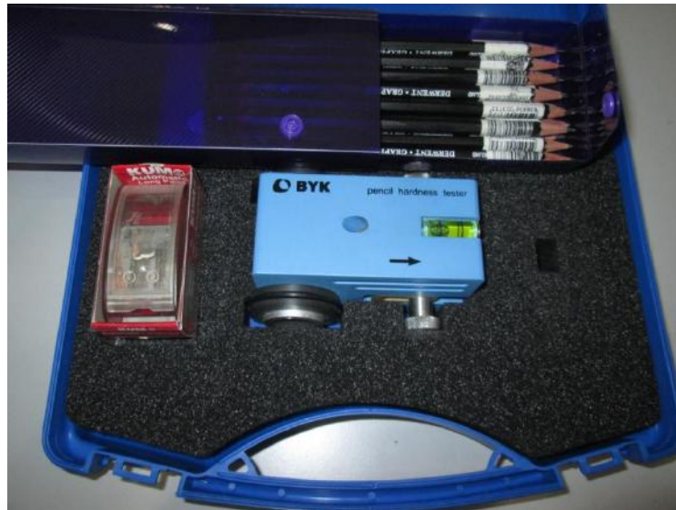
Test Instrument, Pencil Hardness Tester